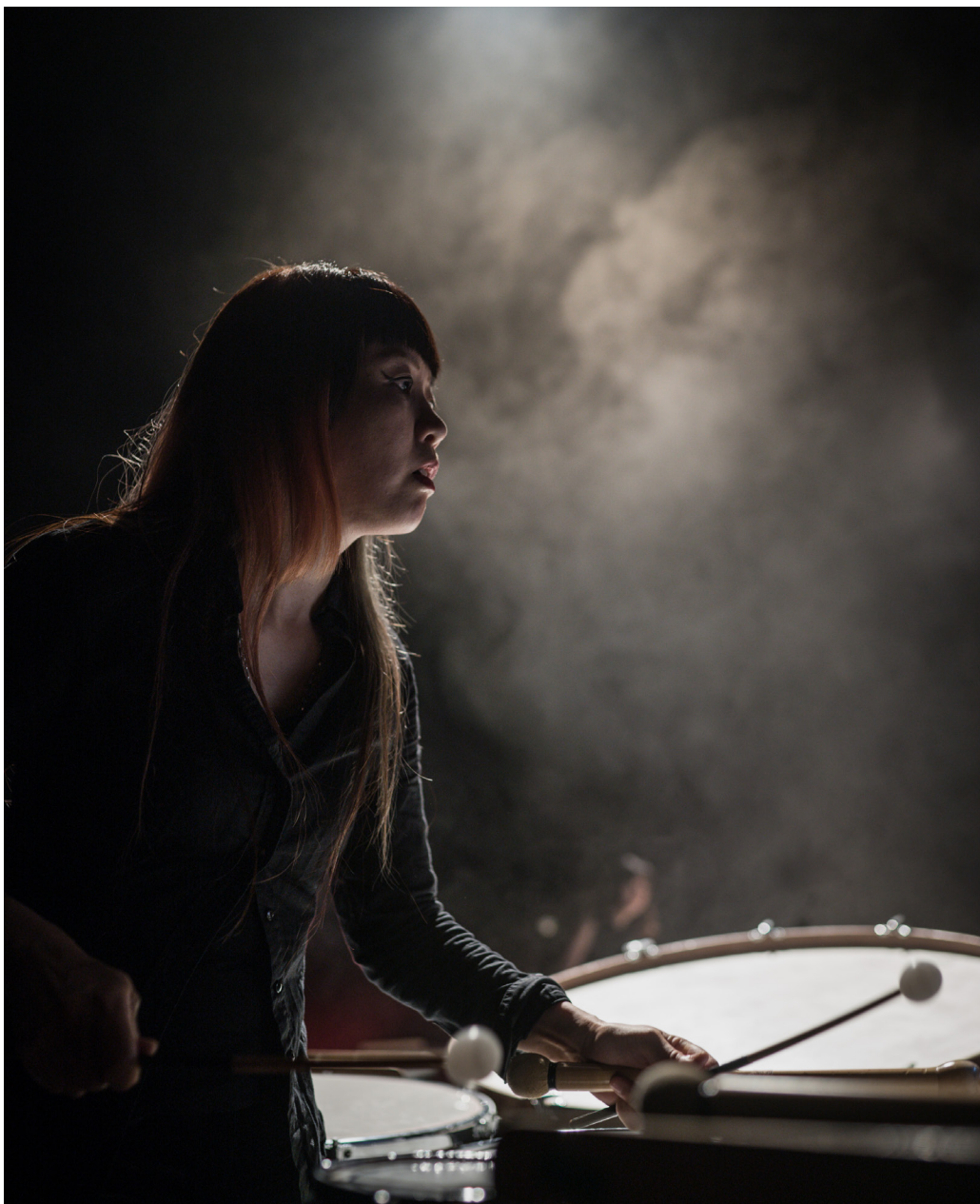
© Jésus s.Baptista 2021 - Pléiades , Théâtre de HautePierre, Strasbourg