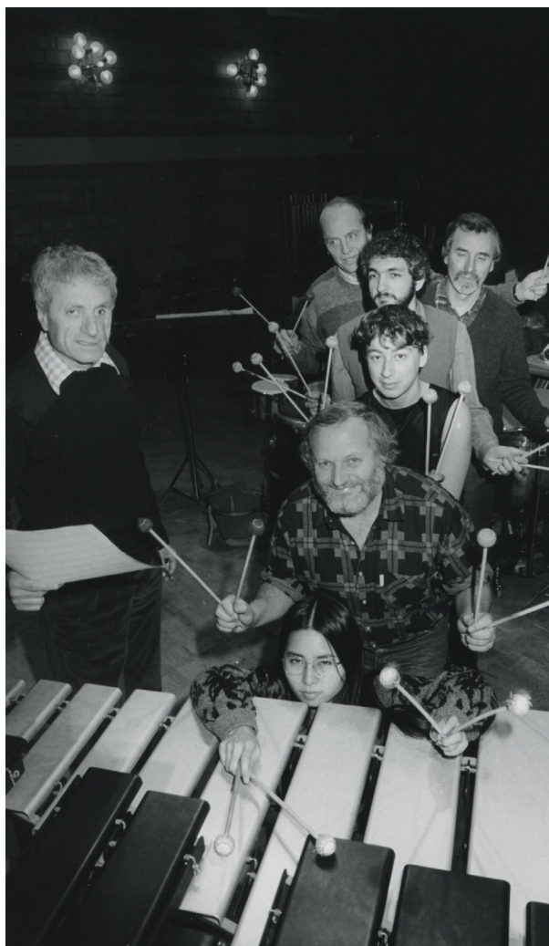
Xenakis and the Percussions de Strasbourg, 1984

It has been said several times that, thanks to percussion, Xenakis reintroduced the problem of rhythm that was thought to have disappeared from contemporary music.