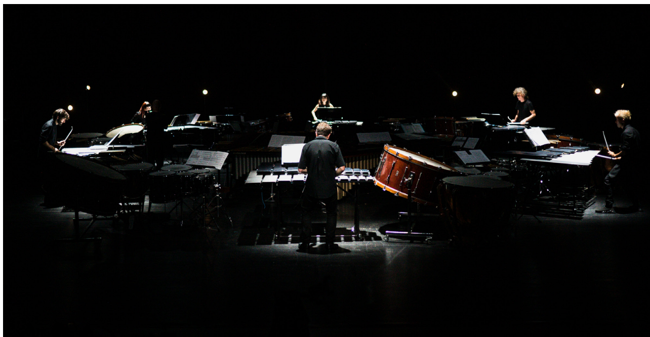
Pléiades, Théâtre de Haute-pierre, Strasbourg