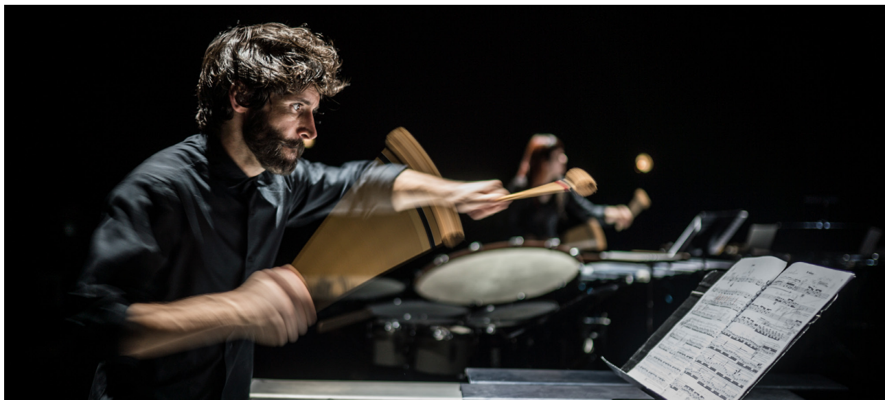
Pléiades , Théâtre de Haute-pierre, Strasbourg