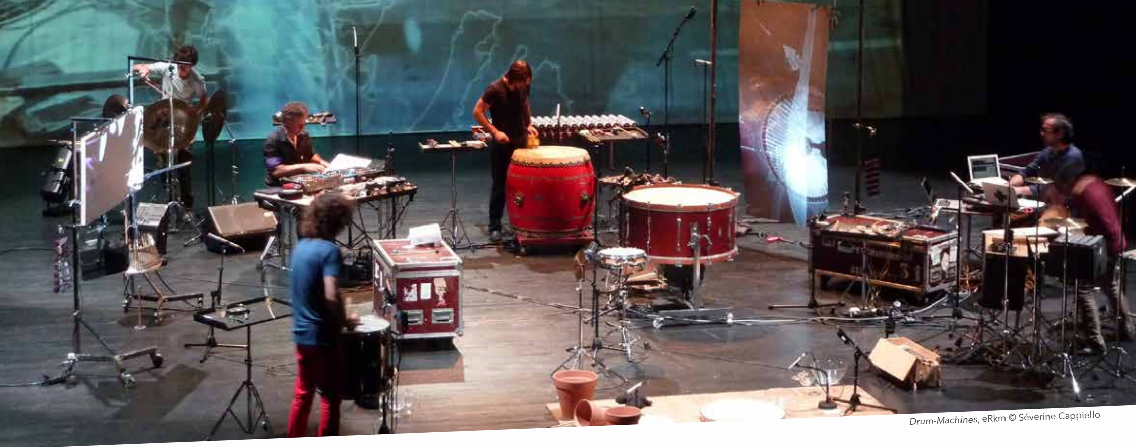
Drum-Machines, eRkm